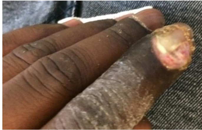
Figure 1: Cutaneous diphtheria in the form of a paronychia appearing after a travel to Mali.

14. Hennart M, Panunzi LG, Rodrigues C, et al. Population genomics and antimicrobial resistance in Corynebacterium diphtheriae . Genome Med . 2020;12: 107. doi:10.1186/s13073-020-00805-7