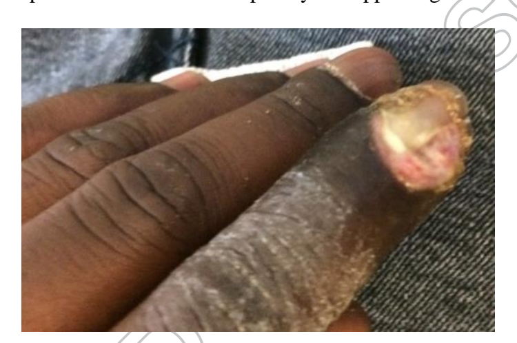
Figure 1: Cutaneous diphtheria in the form of a paronychia appearing after a travel to Mali.