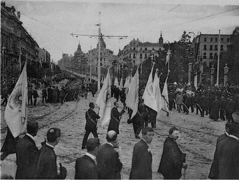
Figure 3 Nocturnal Adoration in the closing procession (International Eucharistic Congress, Madrid).

actions. 79 There was a particular emphasis in the use of military uniform, which, as Morgan argues, absorbs individualities into a generalized and timeless masculinity while also suggesting a control of emotion and subordination to a larger rationality. 80 In this respect, the participation of the law enforcement forces (and in particular, of the military) not only sought to give protection (should any anticlerical violence happened to occur) but was also aimed at increasing the overall solemnity of the procession. 81 The army was