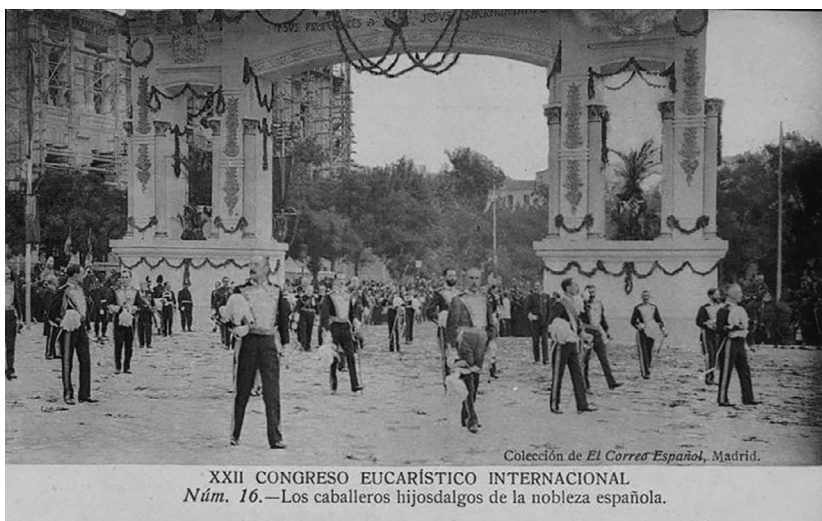
Figure 2 Noblemen in military uniform. From: Museo de Historia, Colección de El Correo Español , Madrid; XXII CONGRESO EUCARÍSTICO INTERNACIONAL, Núm. 16. - Caballeros hijosdalgos de la nobleza; J.L. Lacoste. Biblioteca Digital memoriademadrid : http://www.memoriademadrid.es/buscador.php?accion=VerFicha&id=34071&num_id=9&num_total=36 .

hierarchy would increasingly be recoded as military-like virile self-regulation and discipline. We see this particularly in the Study Sessions of the Iberoamerican section of the IEC of Madrid, which included a panel in which pseudo-historical re-readings of the imperial past and military imperial glories were associated with the Eucharist as a source of bravery and power. Besides this particular rereading of the past, concerns about secularization in the armed forces were also recurrently expressed, and repeated calls to achieve the “restoration of the Christian military spirit” 77 were made by different speakers.