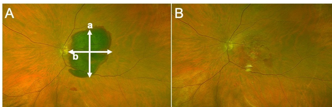
Figure 1. (A) Fundus photograph of a 70-year-old female with macular hematoma of her left eye, due to type 1 choroidal neovascularization consecutive to age related macular degeneration. (a) Vertical diameter, (b) horizontal diameter. (B) Surgery was performed 4 days after presentation, allowing complete displacement of blood from the foveal region.

depression, in the central 1 mm-diameter) height and width of subretinal hemorrhage (SH), subRPE hemorrhage (SRH), and choroidal thickness (CT) by using the manual measure distance option of the manufacturer software (Figure 2). If the SH or SRH was higher or larger than viewable on the OCT B-scan, the maximal presentable height and/or width were measured.