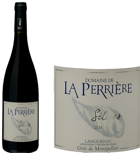
Figure 1. Example of a wine bottle exemplifying references to geology. Here, the estate name “domaine de la Perrière” is derived from a toponym indicating the past location of a quarry. In the appellation “Languedoc – Grès de Montpellier”, the word “grès” refers to the pebbly soils of the area, “Les Silices” to the mineralogy of the local pebbles, and the background illustration is fossil sketch.

(cuvées/vintage), and descriptive texts of the back labels (De Wever et al. , 2009). The diversity of references to geology can be illustrated with an example (Figure 1). In 2003, an appellation “AOC Languedoc – Grès de Montpellier” was erected for red wines produced on the hill slope facing the Mediterranean Sea around the city of Montpellier. The word “grès” does not refer here to sandstone (“grès” in French) but to an Occitan word for stones/pebbles. A local wine estate was named long ago after the local place name “Domaine de la Perrière”, probably in reference to the past location of a quarry. This estate sells a wine vintage “Les Silices” the label of which exhibits the sketch of a fossil in the background. The vineyards, from which “Les Silices” is derived, grow on siliceous pebble stones and fossiliferous limestones.