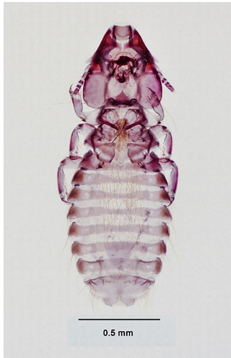
Fig. 3. Parasites, such as this louse (Phthiraptera, Rallicola pilgrimi Clay, collected June 2014, South Island, New Zealand), which went extinct when its host, the little spotted kiwi ( Apteryx owenii Gould), was transferred to predator-free islands (Buckley et al. , 2012), and which is not on the Red List , are almost completely unknown in the assessment of extinctions. Photograph: Creative Commons 4.0. Te Papa (A1.018470).

as a whole, based on Red List data, perhaps because higher vagility and concomitant larger range sizes reduce extinction risk in these highly volant groups.