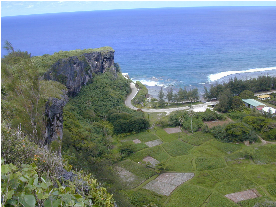
Fig. 5. Rurutu (Austral Islands, French Polynesia) was once home to 19 species of endemic Endodontidae (Mollusca). Despite extensive searches in the remaining patches of native vegetation, such as at the foot of this cliff, only empty shells were found. All 19 species are now considered extinct.

Our most recent numbers (Cowie et al. , 2017) are 638 species extinct, 380 possibly extinct, and 14 extinct in the wild, a total of 1,032 species in these combined categories, and more than twice as many as listed by IUCN (2020) in these categories (462). Furthermore, based on expert assessment of a rigorously random global sample of 200 land snail species (Régner et al. , 2015a), extrapolation estimated that of the