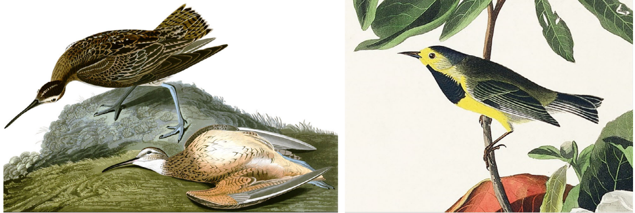
Fig. 2. Extinct but not listed as such, for fear of committing the ‘Romeo Error’. Left: Eskimo curlew ( Numenius borealis (Forster)), from Audubon (1827–1838: plate 208). Right: Bachman’s warbler ( Vermivora bachmani (Audubon)), from Audubon (1827–1838: plate 185 (detail)).