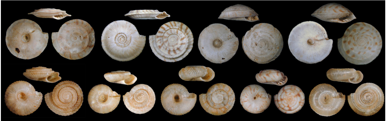
Fig. 4. Recently extinct Endodontidae from Rurutu (Austral Islands, French Polynesia).