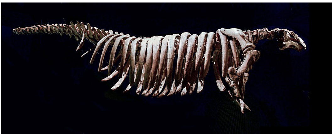
Fig. 7. Steller’s sea cow ( Hydrodamalis gigas (Zimmerman)), one of the few documented marine extinctions, skeleton in the Musée des Confluences, Lyon.

We agree with Roberts & Hawkins (1999, p. 245) that “what is now beyond doubt is that many marine species have