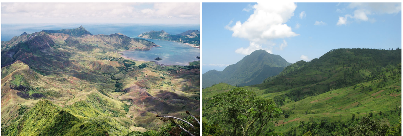
Fig. 6. Right: Tropical islands such as Anjouan in the Comoros, have suffered extensive deforestation for agriculture. Native vegetation is generally completely lacking at lower altitudes, and the highest ridges and mountaintops are now the last refuges of the remaining extant endemic species. Left: Other islands such as Rapa in the Austral Islands, French Polynesia, which has an area of only 40 km 2 and used to have more than 100 endemic land snail species, 59 endemic plant species and 67 endemic weevil species, are now mostly barren. Fires and overgrazing by introduced herbivores have destroyed much of the upper elevation habitat, and the vegetation at lower altitudes is dominated by invasive species.

Environmental health of the oceans is the subject of considerable media attention, that to a large extent tends to treat pollution (e.g. the “seventh continent” of plastic; Ter Halle & Perez, 2020), the collapse of fisheries, and extinction as