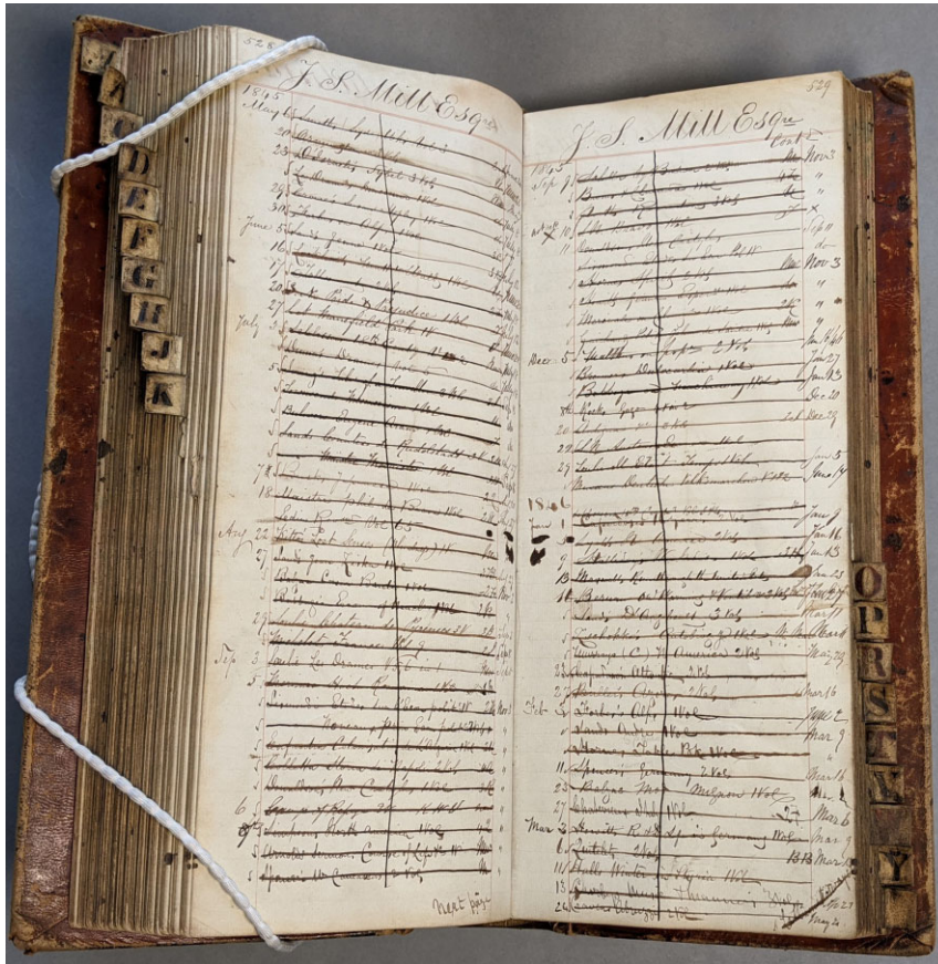
Fig. 1 London Library Issue Book No. 3 showing Mill's intensive borrowing record during 1845, London Library Issue Book Number 3, p. 529. The horizontal lines indicate the return of individual books. The vertical lines indicate that all the books listed on the page have been returned. This is representative of the type of library issue record that required transcription and identification from Mill's loan record. Image reproduced with the kind permission of the London Library. © The London Library