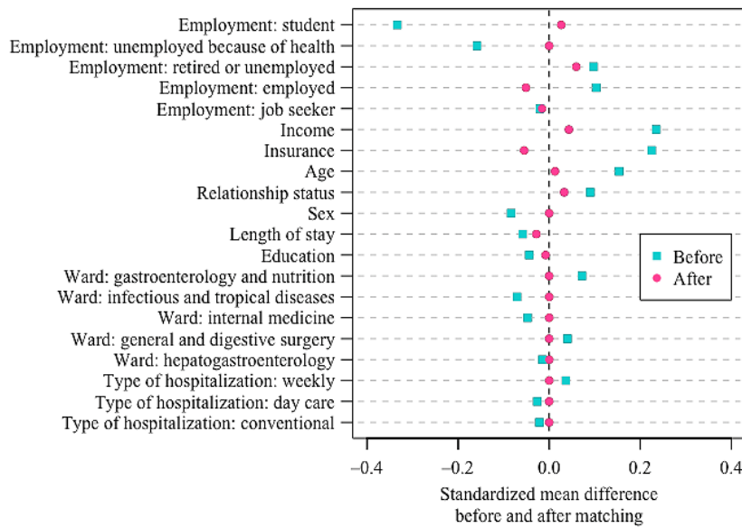
Figure 2. Differences in baseline variables between the internet and telephone responders before and after the matching procedure.