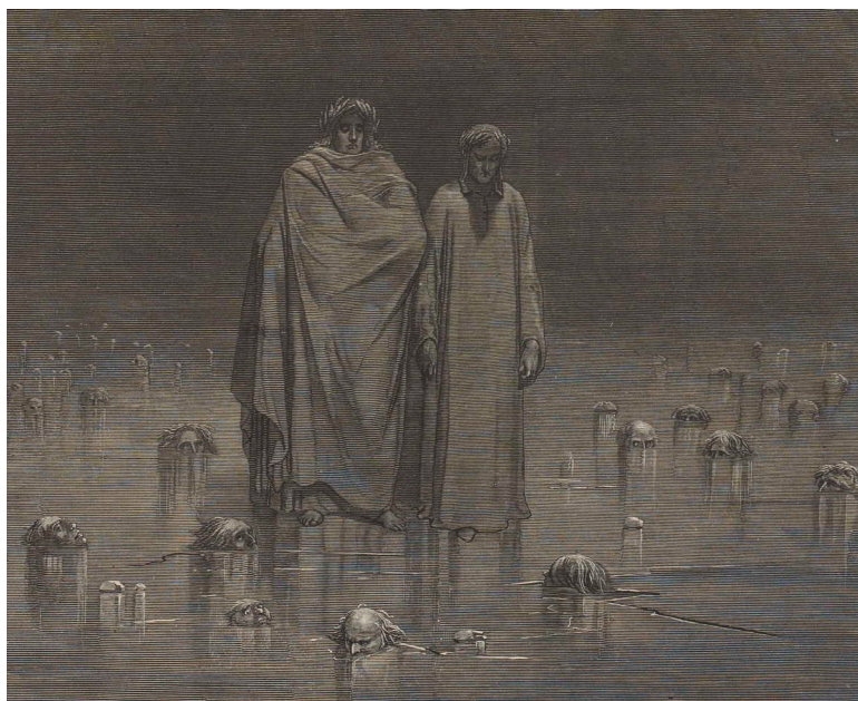
Figure 4. 'I saw a thousand faces purple | with the cold': the traitors frozen in Lake Cocytus ( Inferno xxxii, 70–71). Gustave Doré, Inferno xxxii, 1861, wood engraving.

expressly consists, not in gradually wearing down or consuming, but in congealing into a fixed state. The Commedia takes ice as the ultimate symbol of infernal subjectivity: 20 exposed to the punishment tormenting their body without spiritually softening their soul, the damned are petrified, trapped in their sin, and unable to change or improve. 21