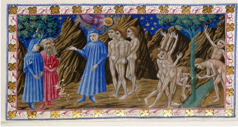
Figure 6. ‘The sockets of their eyes resembled rings | without their gems’: the emaciated gluttons ( Purgatorio xxiii, 31–32). Detail of a miniature by Priamo della Quercia, Purgatorio xxiii, 1440s, MS Yates Thompson 36, f. 107, The British Library, London.

environment is idyllic in all other respects. Yet, in their purgation, these souls are worn to their bare bones: emaciated, their eyes hollow, their face pale, their skinned stretch out over their bones (Figure 6):