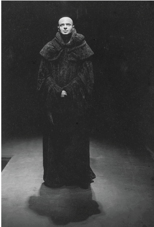
Figure 2. Jack Carter as Mephistopheles in Doctor Faustus . Federal Theatre Project #891, Maxine Elliot Theatre, 1937. Library of Congress Archive, box 101. (WPA Federal Theatre photo; courtesy of the Library of Congress)