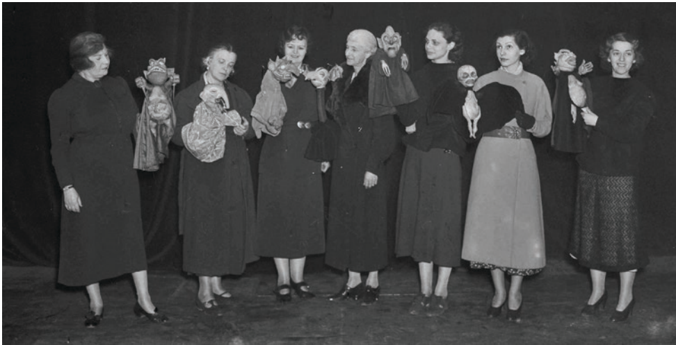
Figure 7. Puppets for the Seven Deadly Sins and their operators in Doctor Faustus (carving out a few parts for women in a male-dominated play). Federal Theatre Project #891, Maxine Elliot Theatre, 1937. Library of Congress Archive, box 101. (WPA Federal Theatre photo; courtesy of the Library of Congress)

It is therefore no surprise that the temptation to keep conjuring, and to revive the work on an actual stage or on the active stage of our imagination, should be so strong.