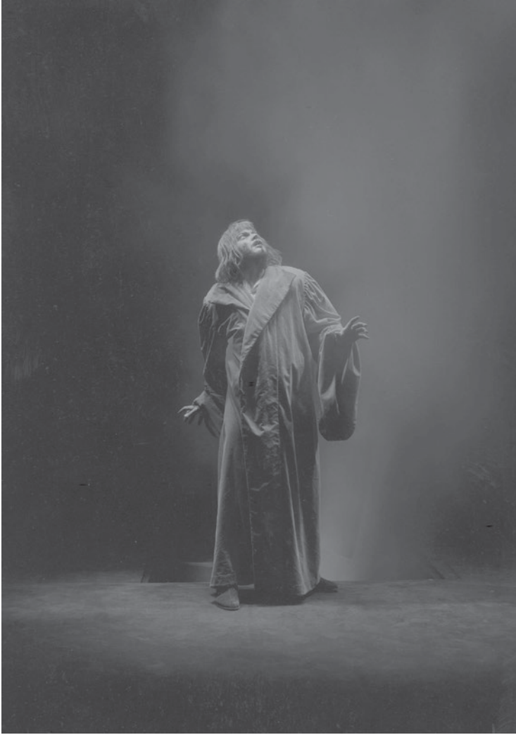
Figure 1. Orson Welles as Faustus in Doctor Faustus . Federal Theatre Project #891, Maxine Elliot Theatre, 1937. Library of Congress Archive, box 101.

one “which comes to represent the whole universe” (6), and most importantly, “a work which relegates the noise of the present to a background hum, which at the same time the classics cannot exist without” (8).