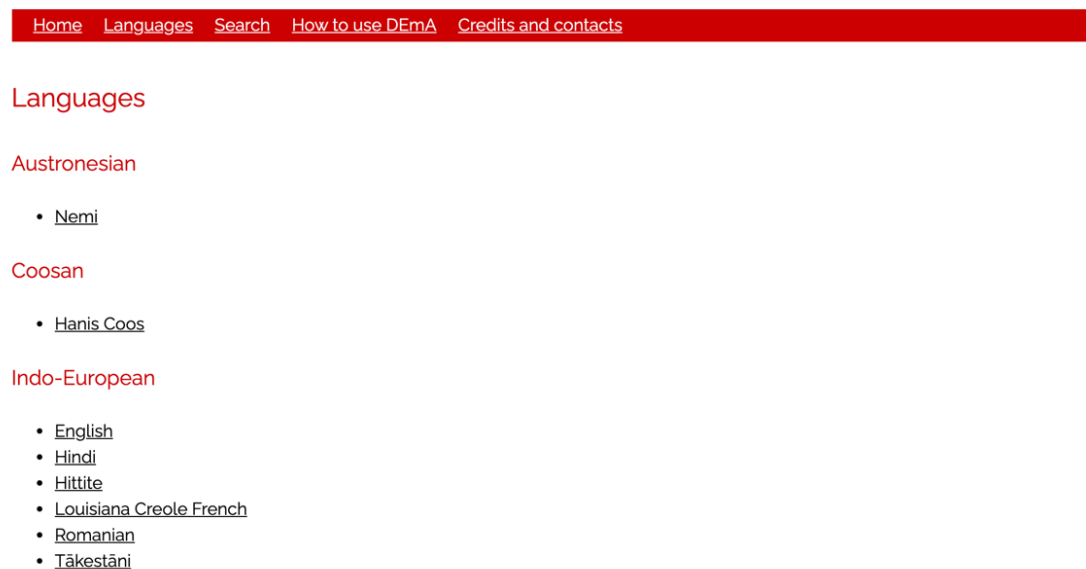
Figure 2. The DEmA Languages interface