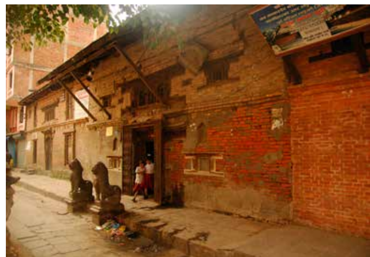
The eastern wing of Itum Bahāl (Kathmandu) before its reconstruction. Carved struts used to adorn the façade before the earthquake of 1934. Five struts now remain there.