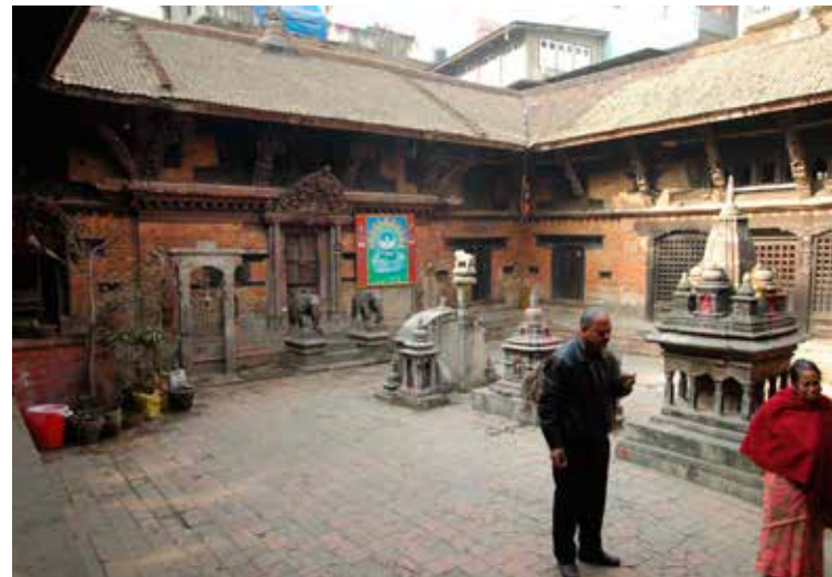
The courtyard of Chusya Bahāl (Kathmandu) and its rich set of struts.

Thus it makes sense here to consider iconographies as essential parts of the Kathmandu Valley's traditional architecture, as much as building typologies and structures.