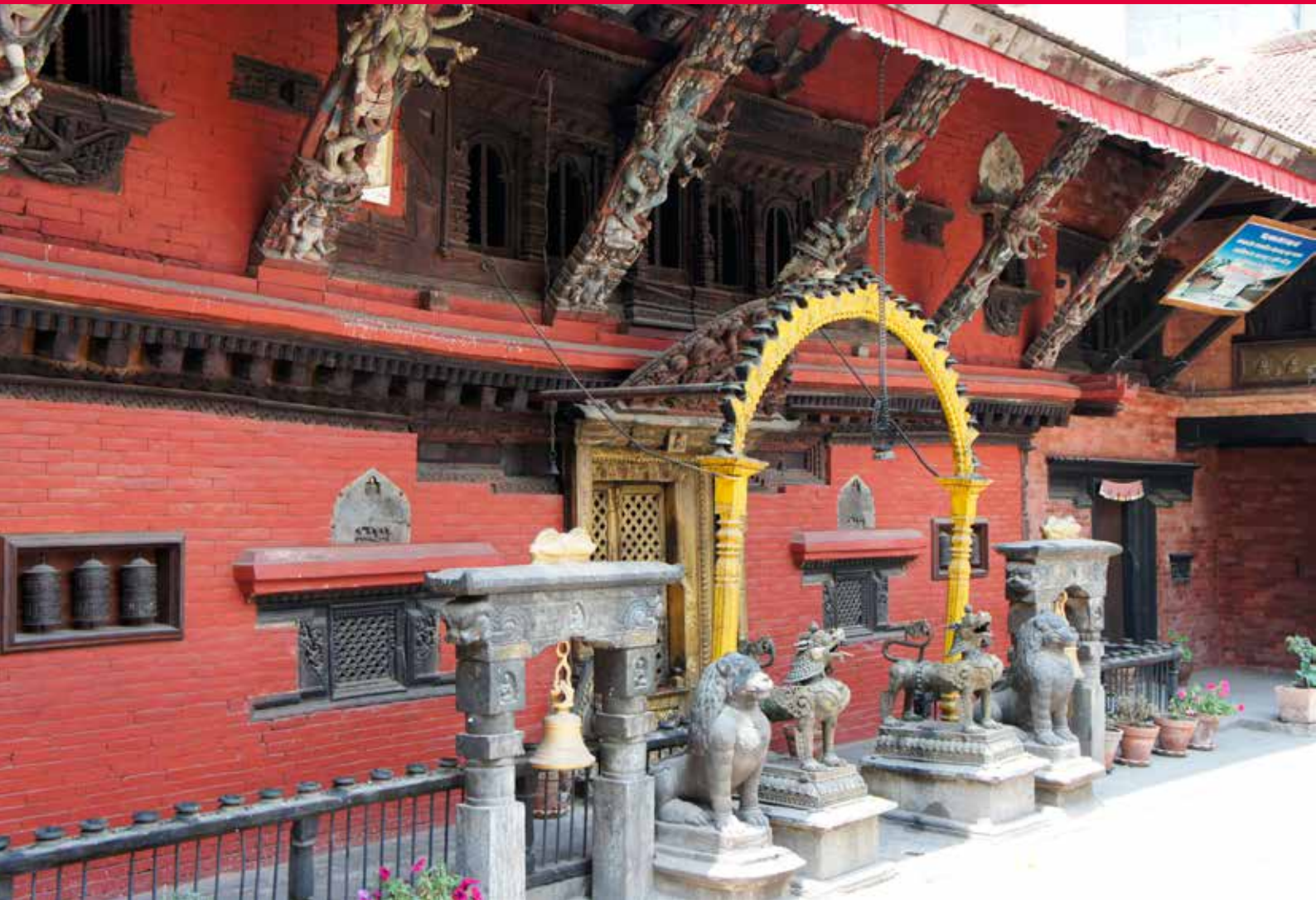
The main shrine of Itum Bahāl, located in the western wing of the complex. Six struts are placed below the roof. They represent six Pañcarakṣās or five Pañcarakṣās and one Akṣobhya.