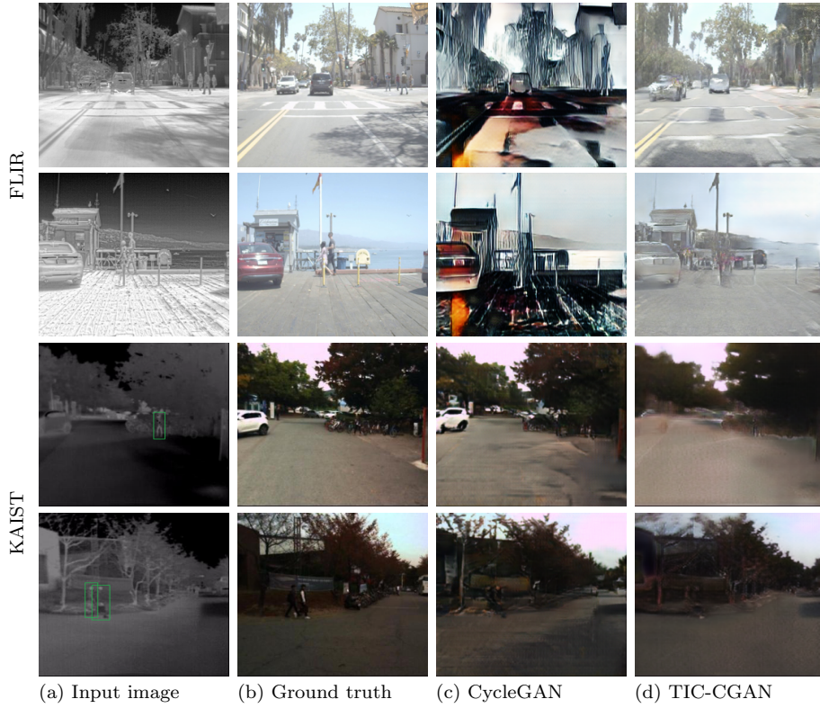
Fig. 3 Qualitative results of CycleGAN [48] and TIC-CGAN [2] on two sample thermal images (the input) with their corresponding visible images (the target) for each dataset. From top to bottom: results of 4 sample images, two first rows showing results on FLIR dataset and the two last rows on KAIST dataset. For each sample image, annotations of target objects present in the input thermal images are drawn with green bounding boxes.

that such unsupervised domain adaptation method is employed for detection in heterogeneous thermal and visible domains. The proposed detector incorporating feature distribution alignments into Faster R-CNN architecture has the advantage of combining different domain classifiers in order to achieve an overall performance. Despite its relevance for practical applications, such adaptation for detection in thermal and visible domains is not yet investigated. By means of tests on two widely used datasets for multispectral detection, the effectiveness of the proposed detector is proven by obtaining better results compared to the baseline detector with an outstanding margin. Its performance also exceeds some existing unsupervised domain adaptation methods for detection in homogeneous domains.