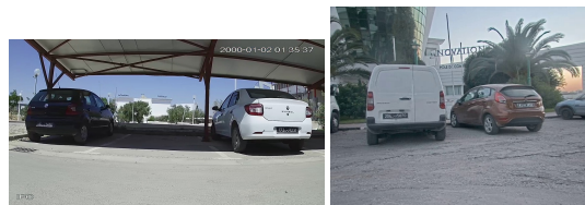
Figure 1: Samples from the PGTLP dataset. The resolution of the images in the left column is 1920 \times 1080 pixels, while in the right column is 800 \times 600 pixels.

Table 1 reviews the key components and modules in the evaluated variants of YOLO detectors and their performances. In the tables below, the values which are quoted in red and green colors, are considered as the lowest and highest, respectively.