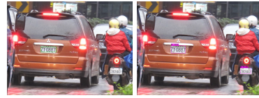
Figure 2: Annotation issue with the AOLP dataset. The left and right columns are the ground-truth annotations and the detected boxes, respectively.

Figures 3 and 4 illustrate few result examples of LP detection in AOLP and PGTLP datasets, respectively using the YOLOv4-tiny architecture. By visual inspection of the obtained results on the two datasets, we note that the YOLOv4-tiny architecture provides