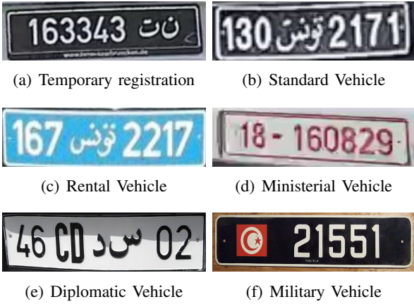
Fig. 3. Multiple templates of Tunisian LP

trolling numerous environments without any constraints. Our dataset incorporates three resolutions: 1920 \times 1080 , 800 \times 600 and 640 \times 480 pixels. Figure 4 visualizes some images of the dataset. In addition, our dataset considers the case of identifying simultaneously many vehicles. Hence, the data images cover not only one LP per image, but also two even three LP per image.