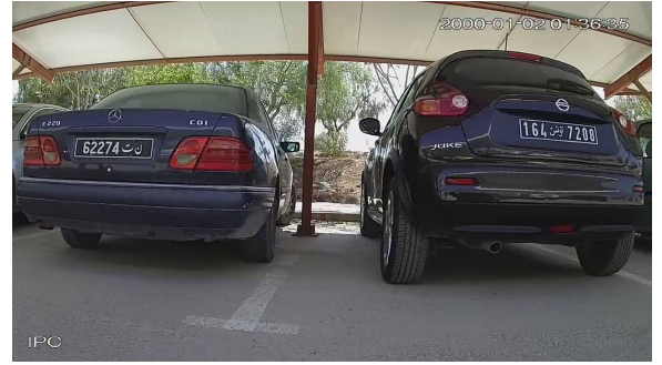
(a) The robot is patrolling and the vehicles are parked.