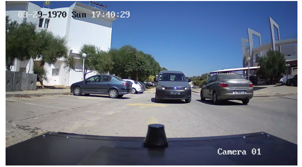
(b) The robot and the vehicles are moving.