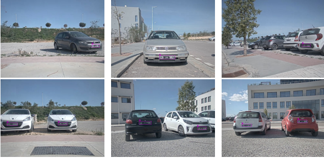
Fig. 5. Result examples of LP detection in PGTLT dataset. Images size is 640 \times 480 pixels.

Figure 5 illustrates few result examples of LP detection in PGTLT dataset using the YOLOv4-tiny model. By visual inspection of the obtained results, we note that the proposed detector provides satisfying results.