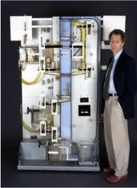
Fig. 2 The Phillips machine

The machine, now a museum piece, was first unveiled at LSE in 1949. It is also known elsewhere as a Moniac (Monetary National Income Analogue Computer). The model brings