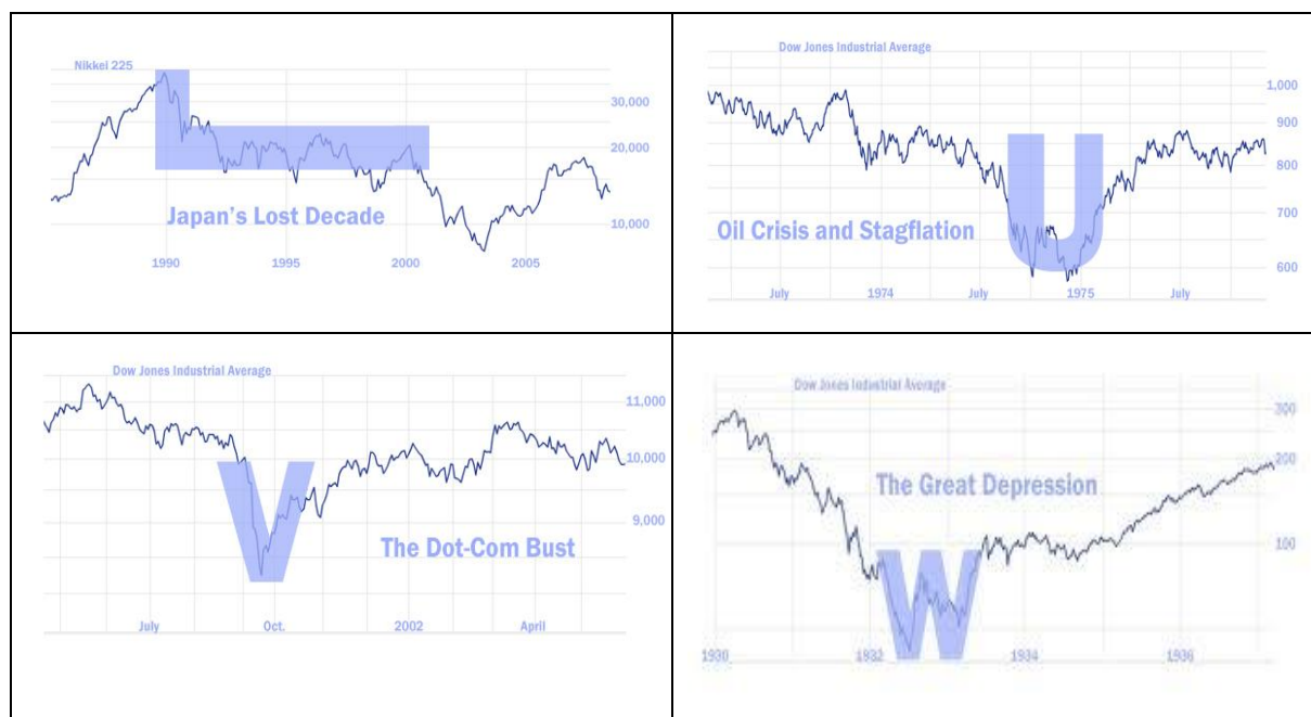
Figure 2 The Shapes of Recoveries

http://investors.lk/12794/Shape+of+the+Recovery