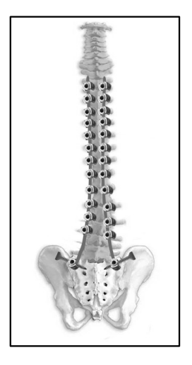
Figure 4. Posterior spinal fusion with ilio-sacral screws.