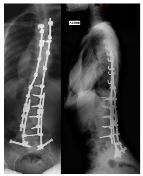
Figure 5. Pre- and postoperative X-rays after posterior spinal fusion.

The minimally invasive fusionless surgery was performed with two small midline skin incisions: the first was centered on the upper thoracic spine, and the second was centered on the lumbosacral junction. Proximal bilateral fixation was achieved at the first thoracic vertebrae using a double claw of the supralaminar and pedicle hooks attached to two adjacent vertebrae and separated by a free vertebra. A rod system composed of two long pre-curved rods was inserted intramuscularly from the proximal incision to the distal incision and attached to the proximal hooks. These rods were retained medially and attached using a side-to-side closed connector to an overlapping shorter lateral rod attached to the distal multiaxial connector of the ilio-sacral screw at S1. The amount of overlap between the two rods corresponded to the required lengthening potential of the construct. To create the final stable frame construct, cross-links were used proximally and distally.