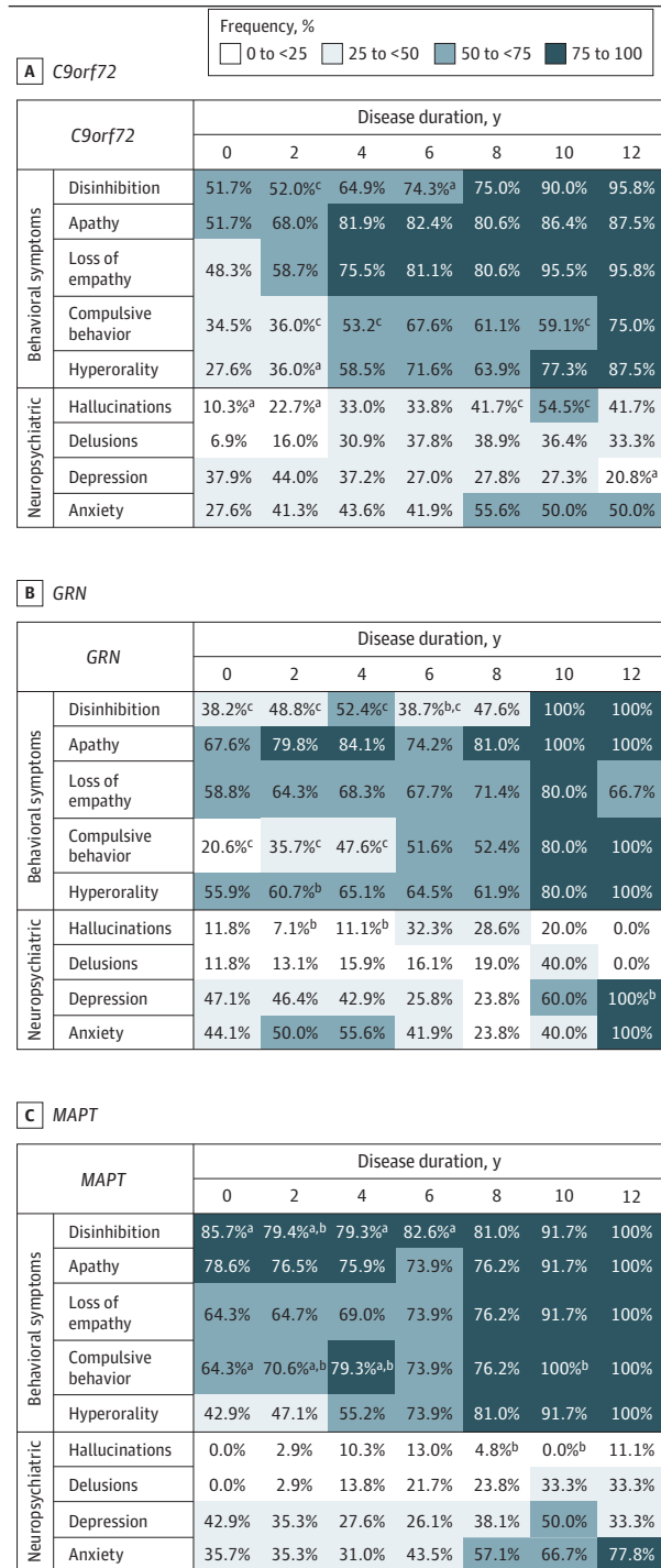
Figure 1. Frequency of Behavioral and Neuropsychiatric Symptoms in A, C9orf72 Expansion; B, GRN ; and C, MAPT Carriers

C9orf72 indicates chromosome 9 open reading frame 72; GRN , granulin; MAPT , microtubule-associated protein tau.