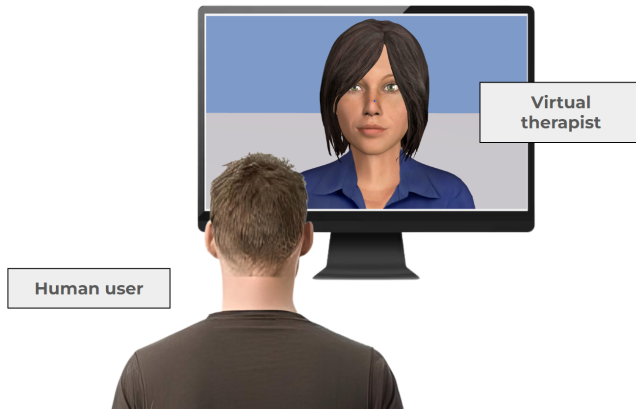
Figure 1: Interaction setup between a virtual therapist and a human user

to adjust the behaviors of agents [1, 8, 23, 29]. Supervised learning approaches such as neural networks, Transformers, and BI-LSTMs have also been used [13, 17, 26, 30], as well as generative models like Generative Adversarial Networks (GANs) or Variational AutoEncoders (VAEs) to produce behaviors in new situations, often conditioning one behavioral modality on others [7, 15, 16]. Diffusion models, which have recently shown performance surpassing that of their predecessors in many areas (Image Generation [18], Computer Vision [9], Multimodal Modeling [3]) have also been applied to human-machine interaction [20, 25, 33], to clone human behavior or generate communicative gestures conditioned through multimodality. The results obtained by these architectures have motivated the use of a conditional diffusion model to simulate interpersonal adaptation during motivational interviews, using an Observation-Action approach to generate the agent’s facial expressions in response to user behaviors.