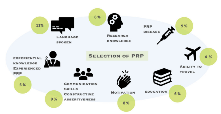
Figure 2 The selection criteria of PRPs reported in the studies. PRP, patient research partner.

Educating and training PRPs was proposed in many papers to enhance the quality of their collaboration with researchers. Notably, nearly half of the publications emphasised the